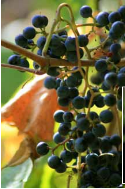
Clockwise from top left: Wild grapes, honeybee pollinating native blackberry flowers, cattails, oak woodland

areas. Some restoration work has been done through Friends of the River Banks, with more planned to bring back a number of the native plant species.