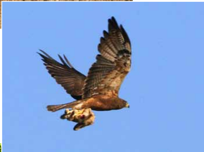
Clockwise from top left: Black-tailed deer, birdwatchers, northern harrier, river otter, raccoon tracks; (center) red-tailed hawk with prey