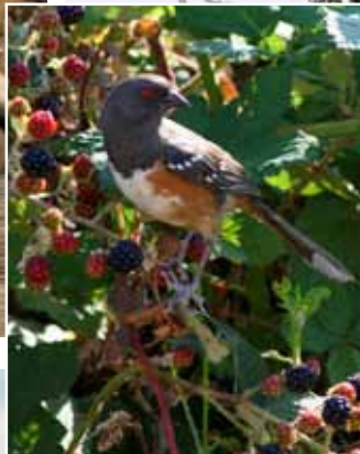
Clockwise from top left: Common egret, Swainson's hawks, birdwatchers, great blue heron; (center) spotted towhee