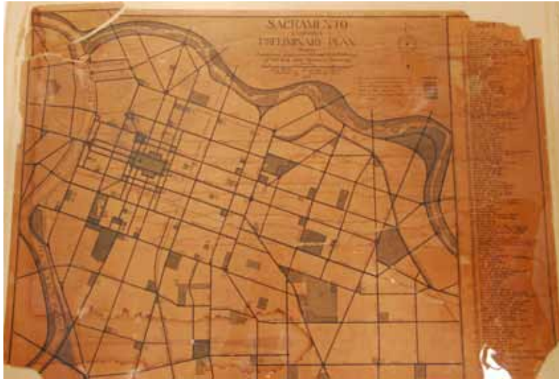
Map of the 1915 American River Parkway Plan by John Nolen.

a number of times since its adoption, including most recently in 2008. The primary goal of the plan is, "To provide, protect and enhance for public use a continuous open space greenbelt along the American River extending from the Sacramento River to Folsom Dam."