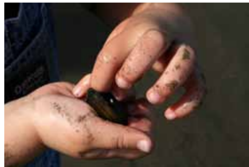
Clockwise from top left: Merganser family with crayfish for dinner; damselfly, clam, looking at critters, exploring the river